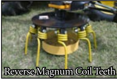
Reverse Magnum Coil Teeth

Standard with new tillage machine model packages. Best for early season cultivation when weeds are just emerging up to about one foot tall. Counter-clockwise rotation away from row.