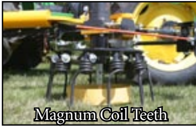
Magnum Coil Teeth

Check our website and call for more on how to use teeth and what will work best for your needs.