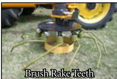
Brush Rake Teeth

Flexible design provides sweeping action. Great for weeds less than 6 inches tall and ideal for ultra-shallow tillage. Excellent for pre-winter sanitizing.