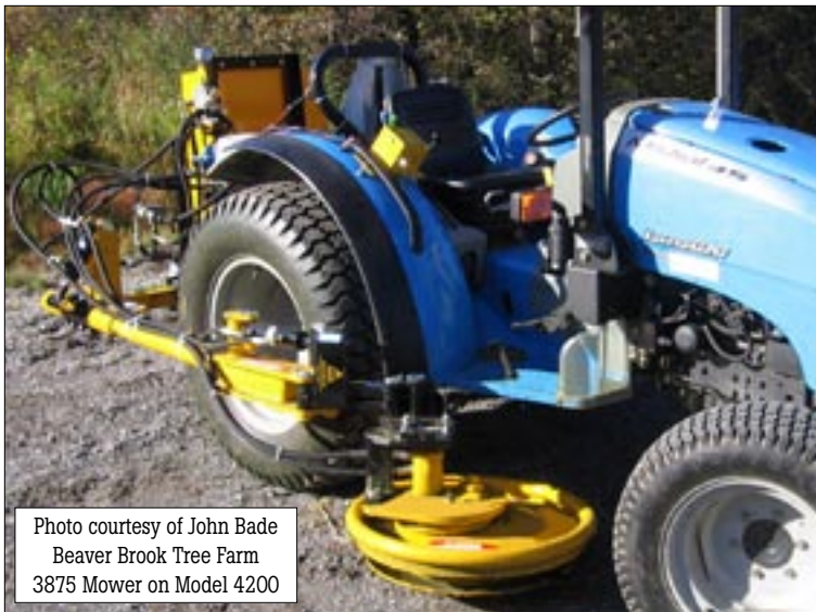
Photo courtesy of John Bade Beaver Brook Tree Farm 3875 Mower on Model 4200