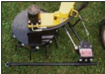
Heavy-Action Sensor Kit on automatic Super Sensor

This medium to light action sensor gently guides the machine in and out of the row with a fiberglass wand. It can be used on trees and vines with at least 3/4-inch (19 mm) caliper trunk.