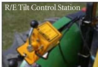
R/E Tilt Control Station

The Retract/Extend Control Lever, located on the R/E Tilt Control Station, allows for easy movement in and out of the row with your fingertips. Choose manual or semiautomatic retract and extend operation. Upgrade easily to fully automatic operation with the optional plug-in Ultra-Lite Automatic Sensor. Match your terrain angle with the flip of the Tilt Switch. Electro-hydraulic tilt control adjusts the side-to-side angle of the working head on the go. Hill-up, build berms, shape strips, and mow terraces. Easy control all day long, acre after acre.