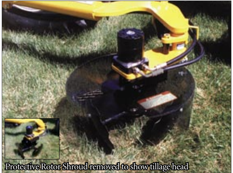
Protective Rotor Shroud removed to show tillage head

Free-turning razor sharp disks spin to slice off then mince tall weeds and long grass. All the action takes place inside the Cyclone Spade's Rotor Shroud. Release the weed killing fury of the Cyclone Spade on your weed problem. Ideal for handling Johnson grass, Bermuda grass, tall or vining weeds. Tackle totally out of control weeds without wrapping or plugging. It's the ultimate "search and rescue" tool.