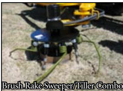
Brush Rake Sweeper/Tiller Combo

Rotate slowly counter-clockwise to rake limbs, branches, cane and brush out of row. Rotate at higher speed to perform fast surface weeding.