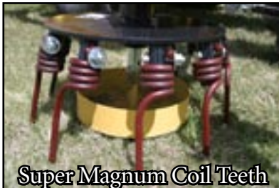
Super Magnum Coil Teeth

Made for clockwise rotation. Use to move soil back toward the row or hill-up over winter. Shape rows, berm, and borders. Edge cover in drive middles.